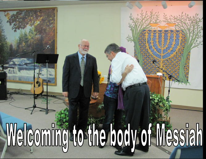
Welcoming to the body of Messiah